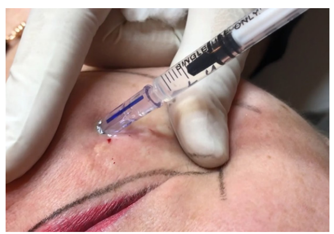
Figure 3: The technique of poli-HA-Biorevitalization with meso-Abo-BoNT.A is visible in this picture. It's important avoid pushing too much and rotate the syringe a bit downward while injecting, to let the very fine needles get free to release the active principle at exactly the basal membrane.

Face neck and décolleté were thoroughly disinfected to remove anyway makeup and face was divided in upper and lower face with a line from tragus to ala nasi. No numbing cream is used since the treatment is quite painless.