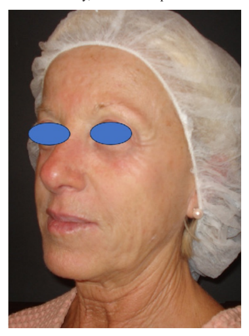
Figure 1: The patient assessment. I underline perioral and cheeks wrinkes, from aging but also mimetic, the neck and periocurar area.

Assessment and Treatment Plan: A 57 years Caucasian lady was assessed pre-treatment: she is smoker, and showed signs of early skin aging, including fine lines around the eyes and mouth, mild skin laxity, and visible pores. After a thorough