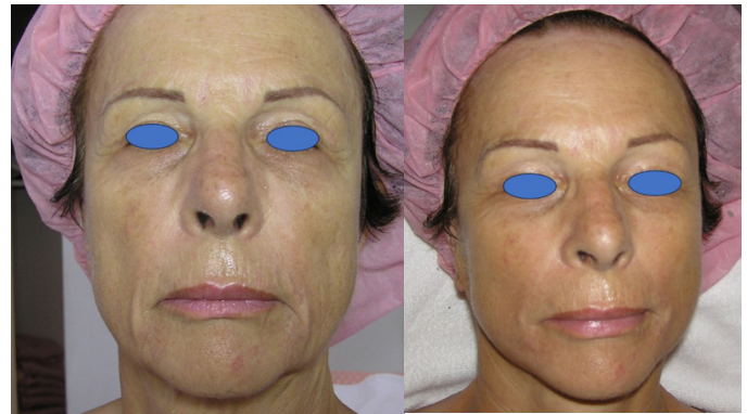
Figure 3: the patient is seen after 45 days (a) after 90 days for 3rd session and after 120 days (b) to take the picture after.

The patient came home immediately with the task to massage the treated areas for 10 minutes twice a day for 10 days. The patient was treated for 3 sessions 45 days apart and closely monitored over this period. The patient's feedback, clinical observations, and standardized assessment scales were used to gauge treatment outcomes. No complain was registered, no bruises, no complications at all.