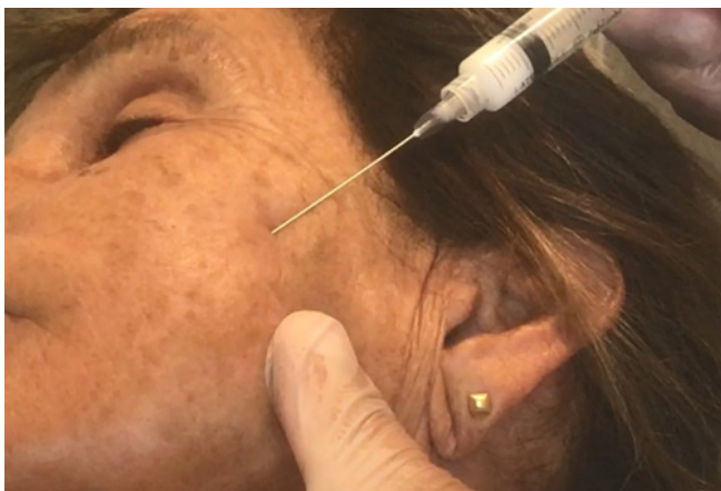
Figure 2: PLLA + HA-Biorevitalizer is injected with a 22G cannula and a fan linear retrograde technique.

A perfectly well done linear retrograde injection is done injecting max 0,1 ml x cm, avoiding injection near the entry point to carefully avoid the possible formation of a hyper concentration of product that could lead to a nodule. I must underline how easy is the injection of PLLA diluted with HA-Biorevitalizer: it becomes very uniform and easy to perform without the formation of clots, frequent instead diluting with only distilled water. Over this the pain, typical of the injection of distilled water, is much reduced and patients complain much less.