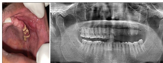
Figure 8: OPG after 6 months.

The postoperative period was uneventful. Patient was kept under antibiotic coverage. Regular irrigation with betadine was being performed on a daily basis and drain was removed on 4th postoperative day and suture was removed on 8th postoperative day. The excision biopsy report confirmed the lesion to be chronic suppurative osteomyelitis of maxilla, which is obviously a rare condition. The healing was uneventful [Figure 8]. The patient is under regular follow-up.