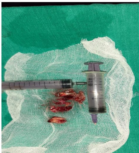
Figure 5: Pathology with root stumps.

The exposed sequestrum was removed along with the decayed root stumps and histopathologic diagnosis was chronic suppurative osteomyelitis. (Figure 4,5).