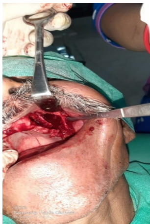
Figure 3: Intraoperative – Flap elevation and exposure of the lesion.