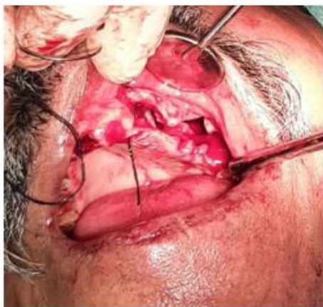
Figure 4: Intraoperative – lesion removal.