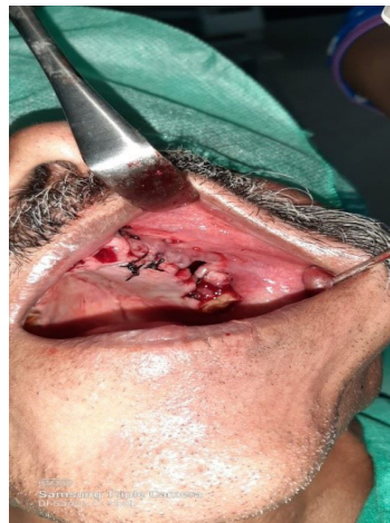
Figure 6: Closure with suction drain.

The exposed sequestrum was removed along with the decayed root stumps and histopathologic diagnosis was chronic suppurative osteomyelitis. (Figure 4,5).