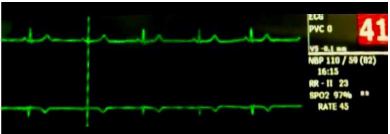
Figure 1: Telemetry strip showing profound sinus bradycardia and normal P-R interval. There was no evidence of pauses, heart block or P-Qrs dissociation.

Shock is a state of decreased organ perfusion that is life-threatening and requires emergent medical intervention. As such, patients who present with shock are hemodynamically unstable and require high acuity care. In critical care and emergency medicine, hemodynamic instability is managed with 30cc per kg boluses of intravenous fluid and vasoactive agents. The ultimate goal of intravenous fluid resuscitation and vasopressors is to prevent multi-system organ failure and to achieve a mean arterial pressure that is greater than 65 mmHg. Refractory hypotension results when patients remain hypotensive despite receiving the appropriate resuscitative fluids and vasopressors. Oral Midodrine has been hailed as an adjunctive therapy in critical care patients with refractory hypotension. It has also been beneficial in patients who become hypotensive during hemodialysis. Nonetheless, Midodrine is only FDA approved