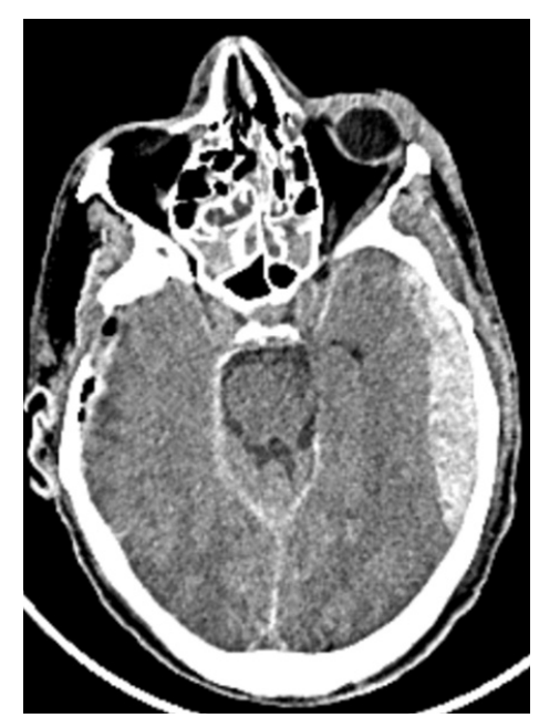
Figure 2: Post operative CT scan showing contralateral epidural hematoma.

[3]. Immediate postoperative CT scan is very important especially if we had a contralateral skull fracture, brain swelling or high intracerebral pressure after surgery.